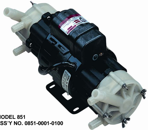
MODEL 851 ASS'Y NO. 0851-0001-0100