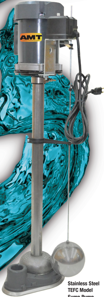
Stainless Steel TEFC Model Sump Pump