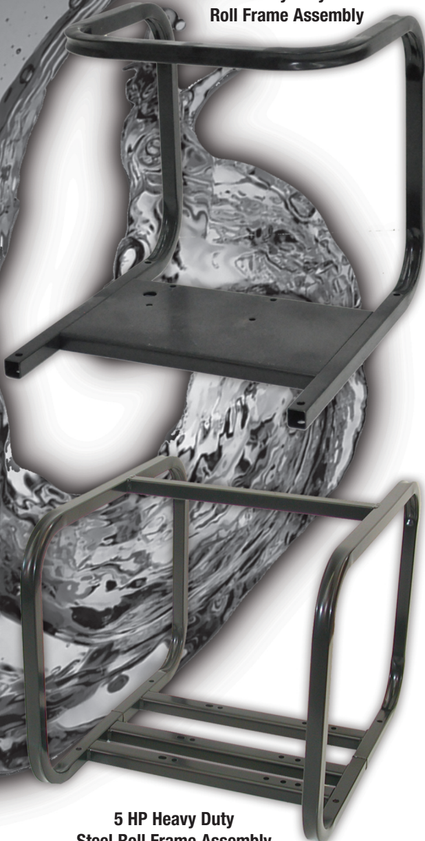
5 HP Heavy Duty Steel Roll Frame Assembly