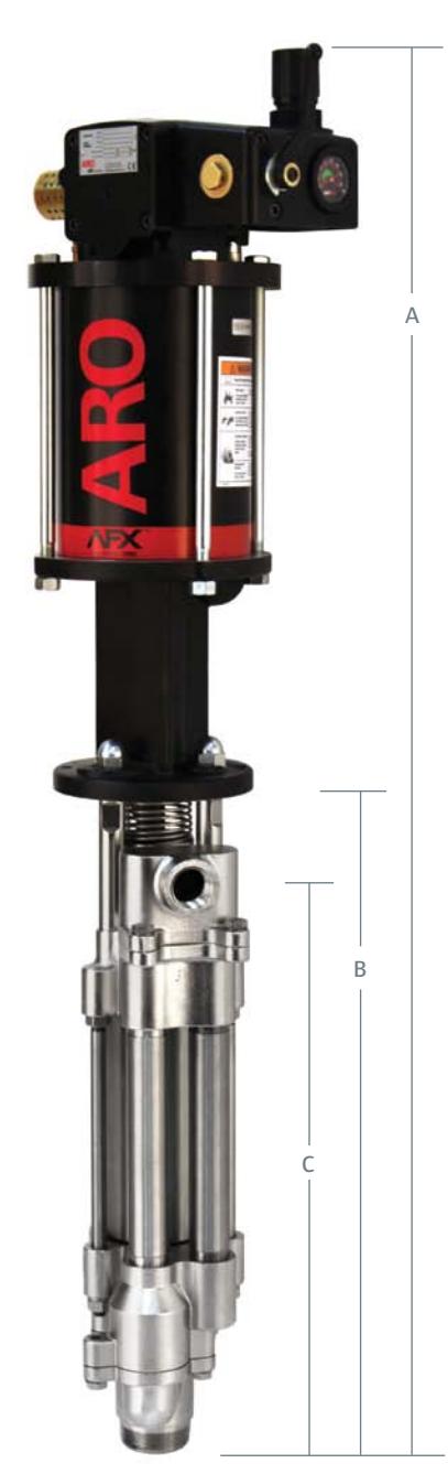
(Model shown w/ball valve regulator)