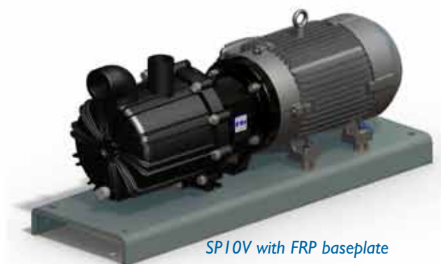
SP10V with FRP baseplate