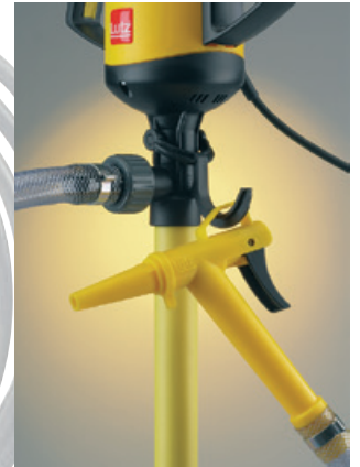
Hook for storing nozzle and power cord at the pump