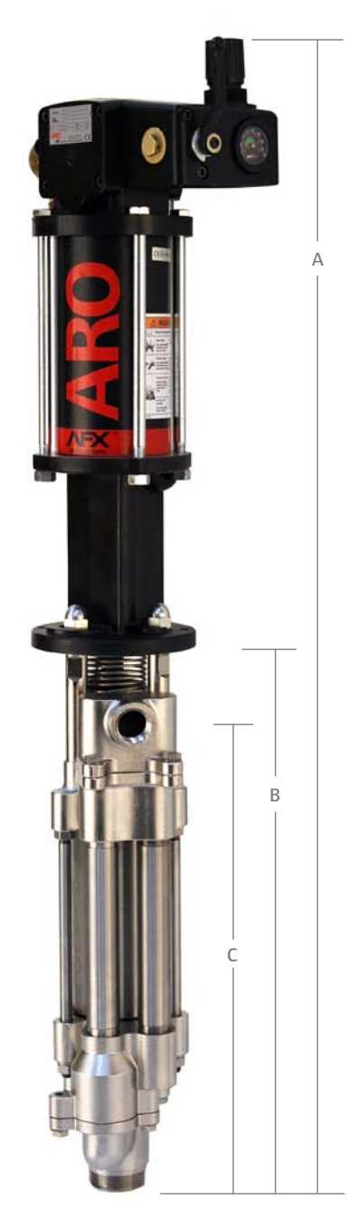
(Model shown w/ball valve regulator)