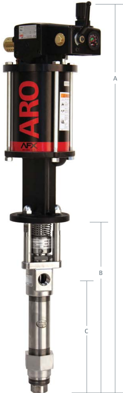
(Model shown w/ball valve regulator)