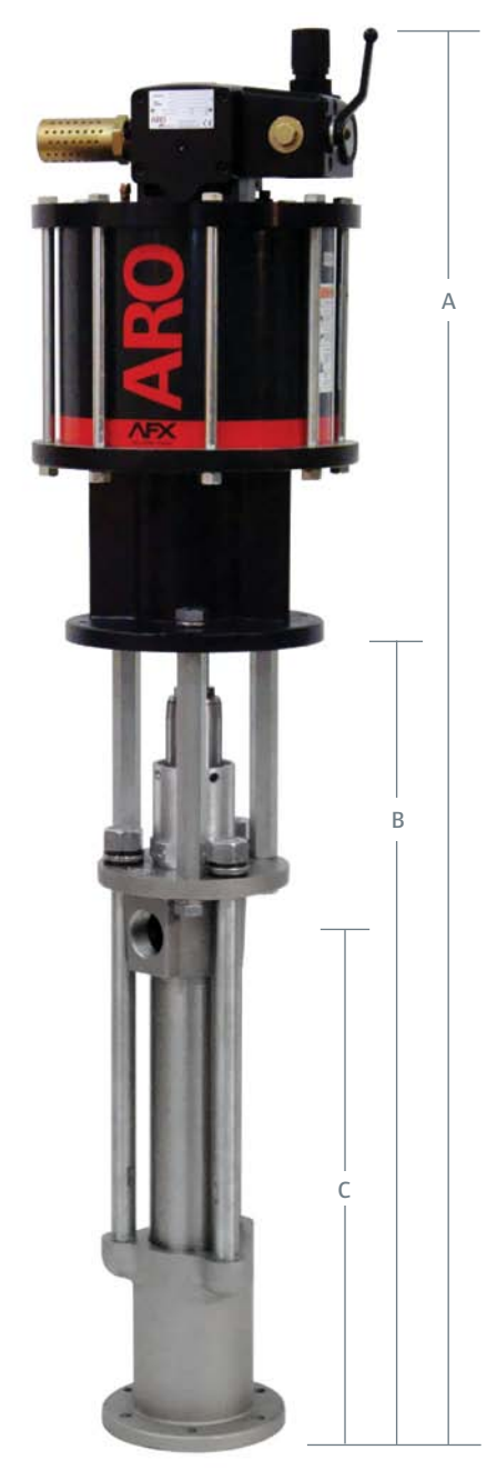
(Model shown w/ball valve regulator)

20:1 Ratio, 10" Air Motor, Chop-Check Lower End