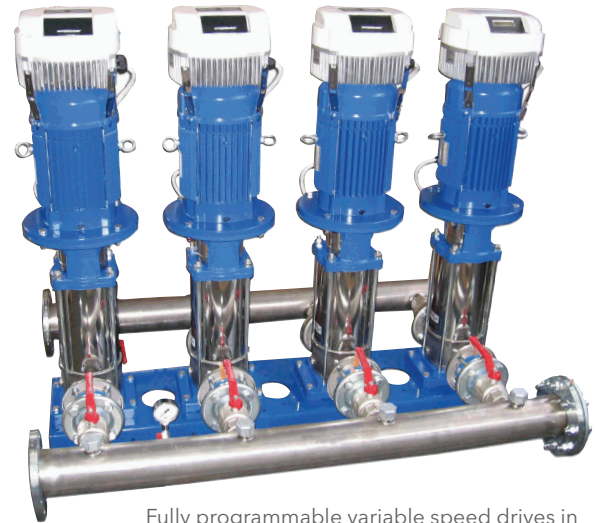
Fully programmable variable speed drives in space saving pump-mounted design

The Hydrovar controller is a combination of a variable frequency drive and a programmable logic controller (PLC) in one compact package, is mounted on the fan cover of a TEFC motor. Drives are pre-programmed with patented pump specific software, designed for centrifugal pumps. They match pump output to a wide range of system conditions while protecting the pump, the motor and the pumping system.