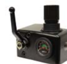
67442 Ball Valve Regulator