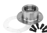
67136 Floor/Follower Plate Adapter