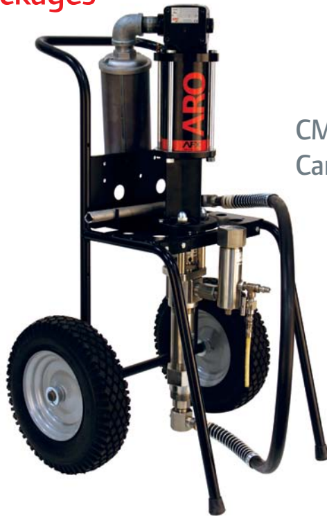
CMX Series Cart Mount