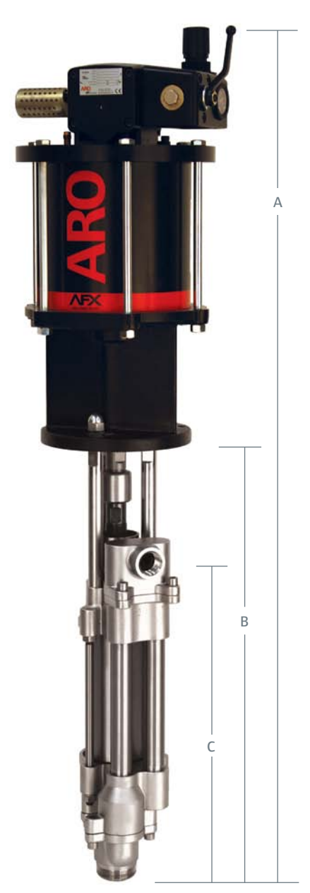
(Model shown w/ball valve regulator)