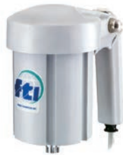
ODP (S1, S2, S3, S6*)