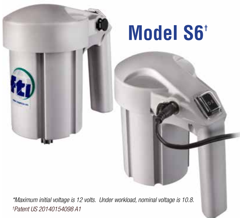
Model S6 +