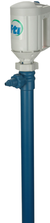
PFP with M3V motor