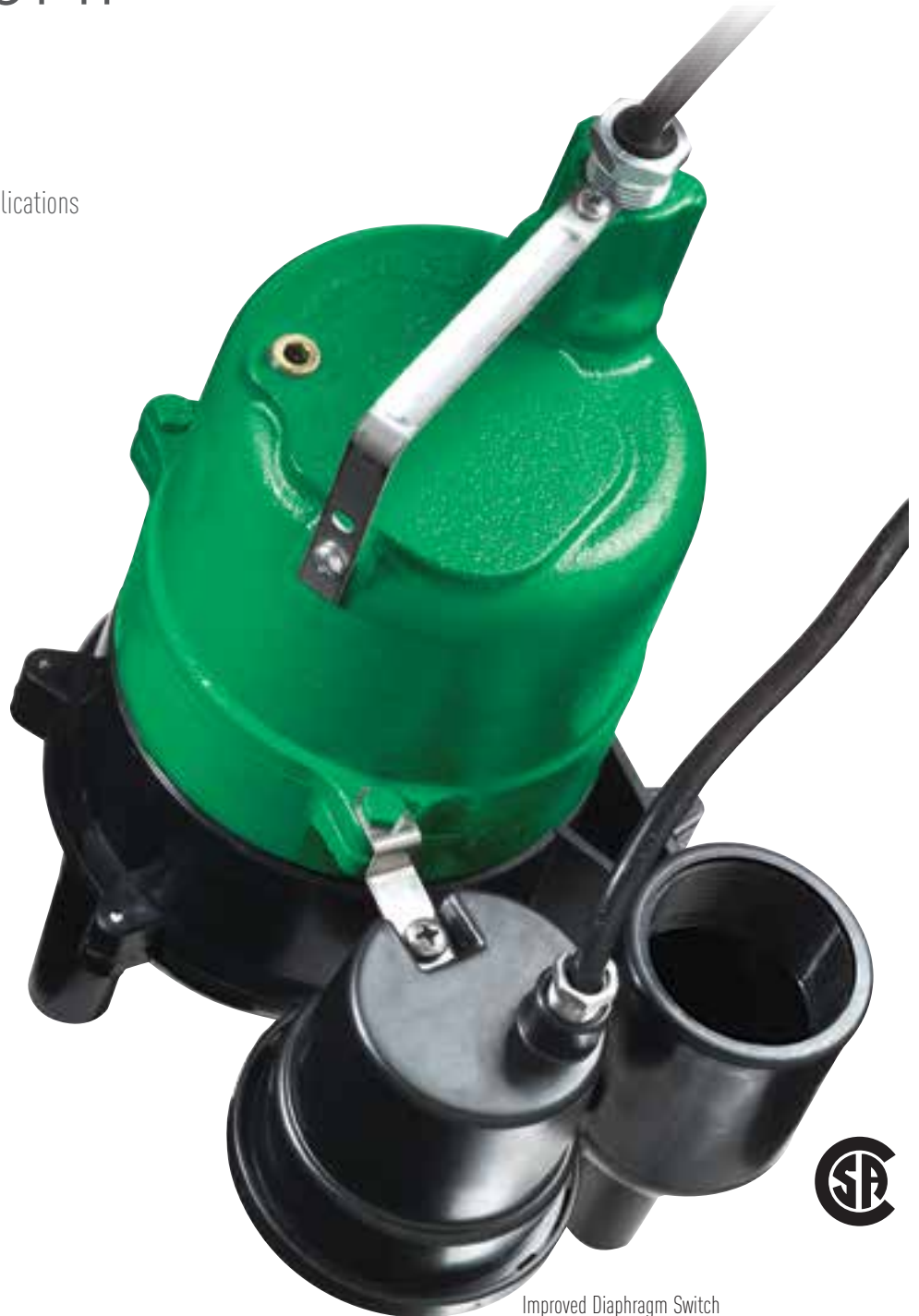
Improved Diaphragm Switch