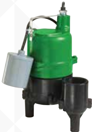
Wide angle float operation available