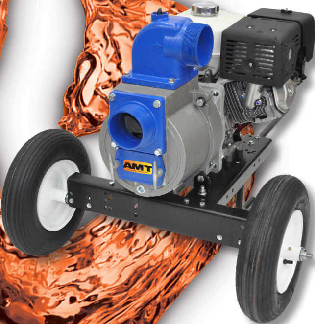
4" Engine Driven Trash Pump