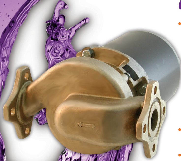
Bronze Circulator Pump

AMT Inline Circulator Pumps are designed for continuous duty industrial/ commercial systems. Pumps are available in a variety of material configurations to meet your specifications. All models are powered by a single phase 115 VAC ODP 56J NEMA frame 1/4 HP electric motor with 1/2-14 NPSM conduit connection. Direct coupled design eliminates stub shaft, oiled bearing and coupling, reducing maintenance. Pumps are interchangeable with other manufacturers, see cross reference on specification page.