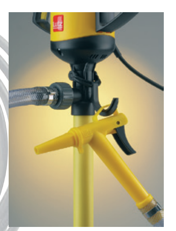
Hook for storing nozzle and power cord at the pump

The perfect solution to transfer small amounts of liquid