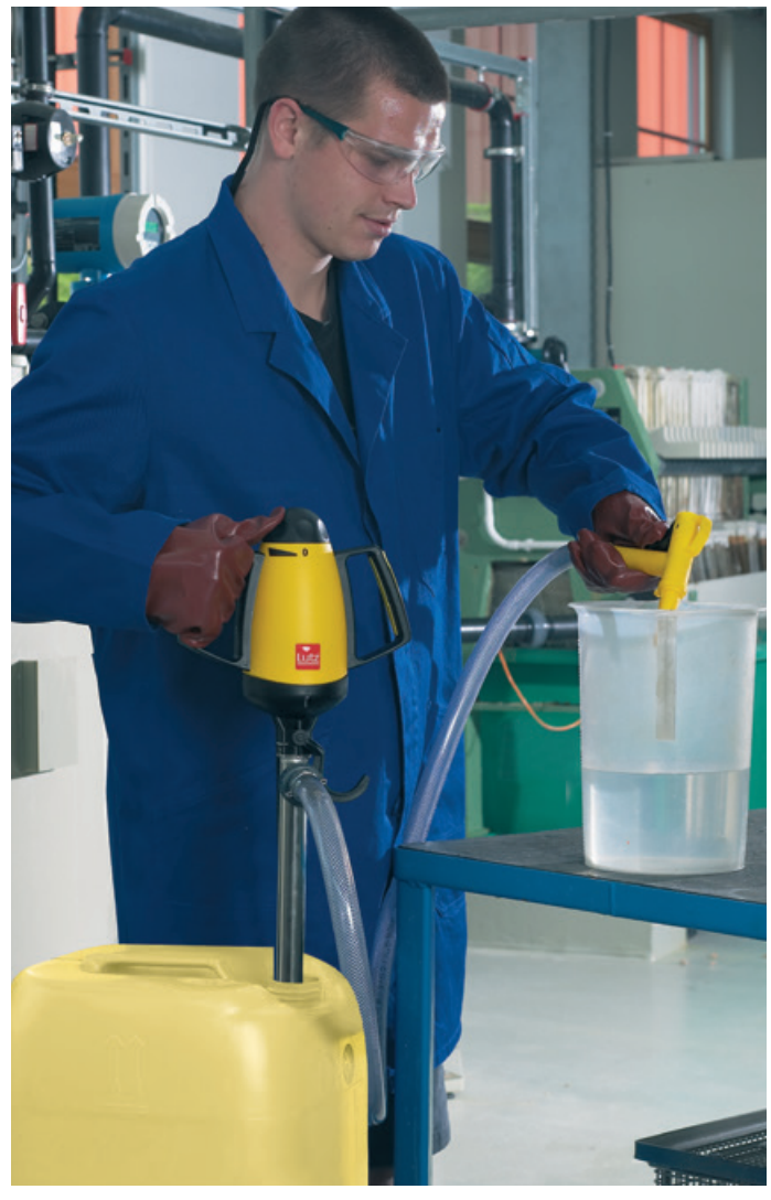
Lutz B2 Vario stands for: Versatile, maximum possible safety, and optimum price-performance ratio.

The new pump generation Lutz B2 Vario: Perfect for the laboratory and research sector